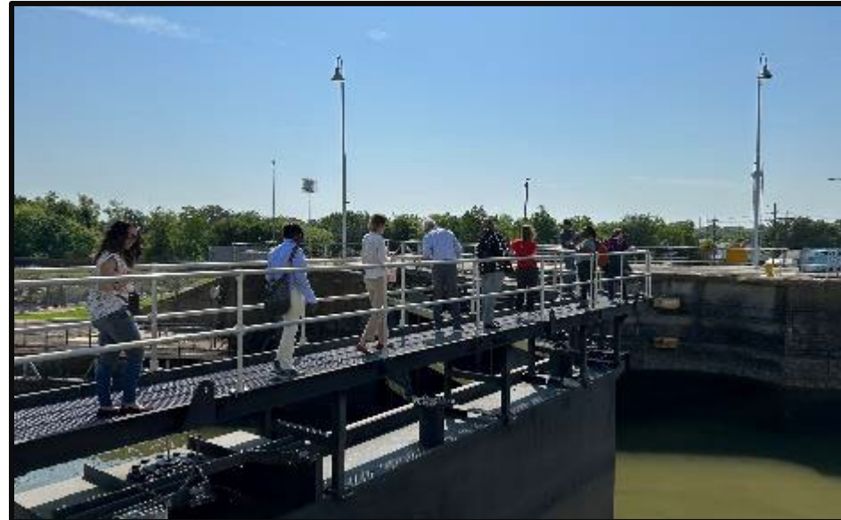
16 MAY 2023: CIMP Kickoff Site Visit to IHNC Lock