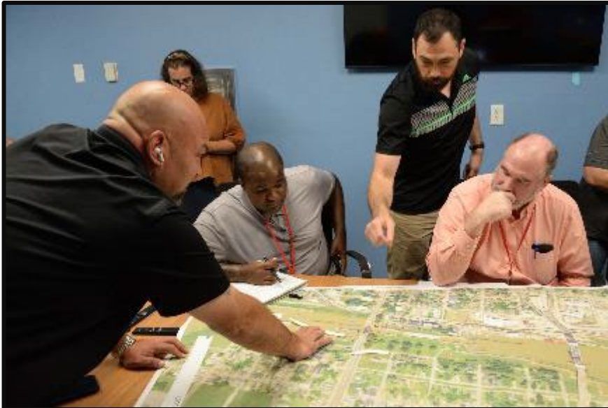
14 JUN 2023: Tabletop Model Exercise at ERDC